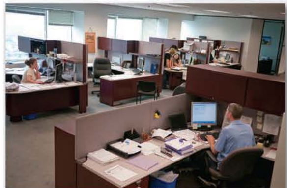
New Orleans Corporate Office