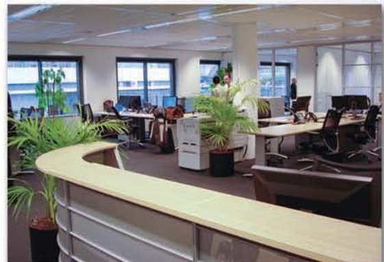
Amsterdam Corporate Office