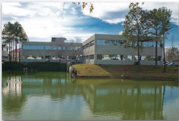
Tomball, TX Feed Products Office