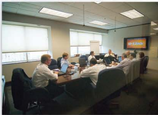
New Orleans Corporate Office

Besides turning in a profitable performance, Westway maintained a strong balance sheet position. Total assets at December 31, 2010 were approximately $495 million, supported by shareholders' equity of approximately $292 million and a working capital ratio of approximately 1.6x. During the year, we expanded our bank credit facility to $200 million and obtained a relaxation of some of our facility covenants to support our future growth and acquisition plans. At December 31, 2010, we had borrowings of approximately $88 million drawn on our $200 million credit facility. We also improved our capital structure and the market perception of our stock by successfully completing a tender offer for our publicly traded warrants, which resulted in the retirement of approximately 34 million of these securities. In addition, our board approved a stock repurchase program, which is ongoing, and will continue to enhance shareholder value.